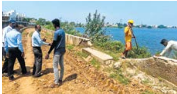
Work is in full swing for the rejuvenation of the Ayanambakkam Lake. The project is likely to be completed before Dec, 2025

THE rejuvenation of 10 lakes across the Chennai Metropolitan Area by the Chennai Metropolitan Development Authority (CMDA) is on the move. The Ayanambakkam Lake also finds a place for which work has already started. The other lakes include those at Perumbakkam, Retteri, Madambakkam, Velachery, and Adambakkam. The detailed project reports (DPRs) are ready for most of the lakes. The CMDA policy note states that the development seeks