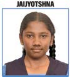
NATIONAL CYCLING GOLD MEDALLIST