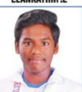
INTERNATIONAL SKATING CHAMPION