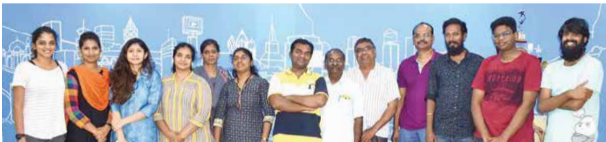
Some of the volunteers of Happy Paws

If you ever come across an injured animal on road in Mogappair and not knowing what to do, call Happy Paws