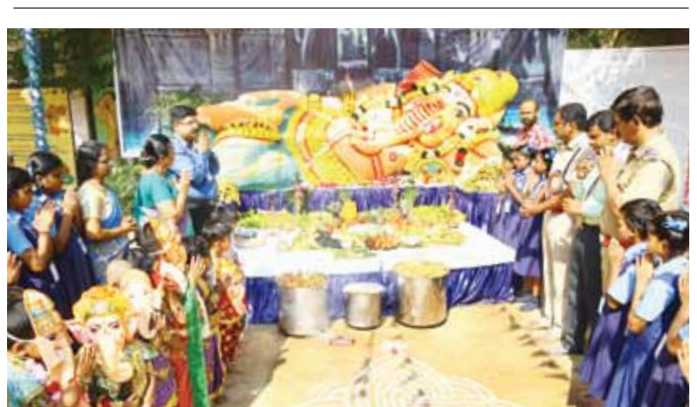
The students of Velammal West had made a 18ft length and 5ft height sculpture of Ganapathy with 'karisal kattu kaliman' on account of Vinayagar Chathurthi celebration which was held on Tuesday.